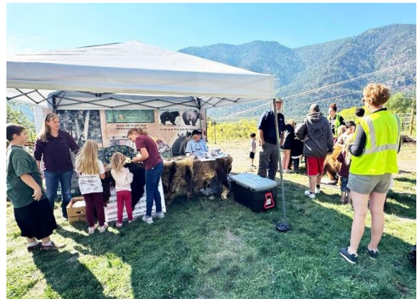
Alberton School students learn about bears at Brovold Community Orchard.

Numerous public outreach and information and education activities were conducted in 2025. The events were tailored to specific audiences within a broad spectrum of age groups and backgrounds. The events included information on the efforts to make Alberton a Bear Smart Community, bear identification, bear biology and behavior, and bear safety. In total, approximately 1,000 people were reached during the year. The following is a list of events where Bear Smart Alberton was the main or a participating presenter.