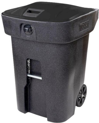
Toter fully automated bear-resistant cart.

With residential garbage being the most abundant bear attractant in Alberton, direct conflict reduction work in 2025 focused on replacing standard garbage containers with bear-resistant containers. This work utilized funds from Phase 1 of the AtBC grant. Eighty-seven Toter brand 96-gallon fully automated bear-resistant garbage containers were ordered at a cost of $21,750. Republic Services donated additional funding of more than $6,000 for shipping. This brand and model of container was selected for its cost effectiveness, simplicity of its latching mechanism, and its bear-resistant certification by IGBC. The containers are expected to arrive in early 2026, when they will be distributed to residents in the portion of Alberton north of Railroad Avenue. This area was selected because this is the location where most bears enter town. Residents receiving the containers will not see any increase in their garbage service bills.