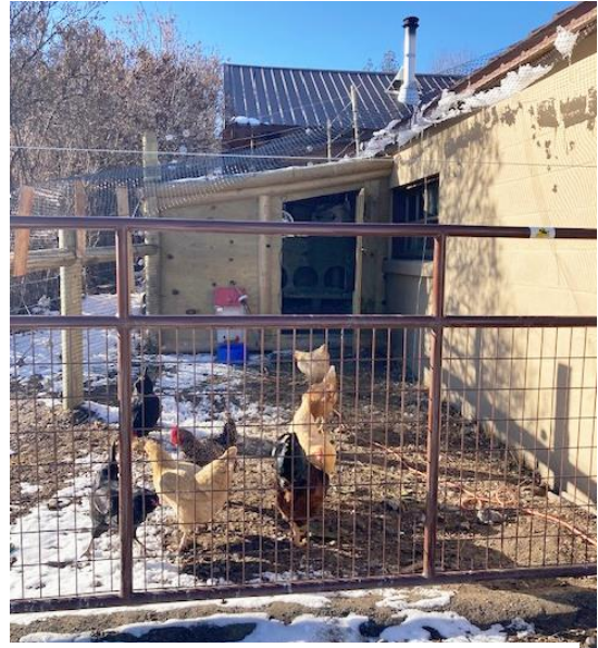
Chicken coop completed in Alberton by BSAWG.

Small livestock fencing costs can be quite variable depending on the type of livestock and the condition of current facilities. Attaching electric fencing to a well-made existing pen or coop may only cost a few hundred dollars. Building an entirely new pen or coop may cost a few thousand dollars. The costs will be less, obviously, if homeowners do the work themselves as opposed to hiring someone to do it. In early 2024, BSAWG completed two demonstration fencing projects in Alberton using contracted labor. One was a completely new chicken coop and pen, whereas the other was installing electric wire around an existing pen. The total cost of both projects was just over $5,000. Some conservation groups, such as Defenders of Wildlife, will reimburse homeowners for part of the cost of erecting electric fences. BSAWG funding for demonstration projects comes through grants from some of these conservation groups.