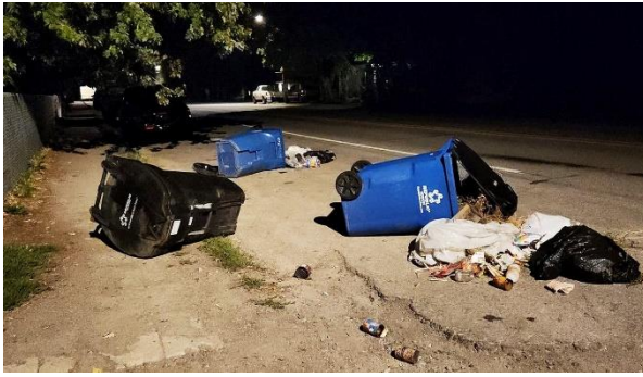
Garbage strewn on an Alberton street by bears. Note the bin on the left is bear resistant. Bears tipped it over but were unable to get inside.

At all these sites, garbage should be secured to be unavailable to bears. For some of the smaller commercial outlets, one or more standard bear resistant 96-gallon garbage bins may be adequate. For larger outlets requiring dumpster sized containers, the containers should be stored in an electrified, fenced enclosure or a containment structure with a roof and stout doors. These enclosures typically include a concrete floor to prevent