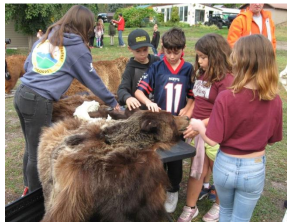
Alberton school kids learn about bears at Brovold Community Orchard.