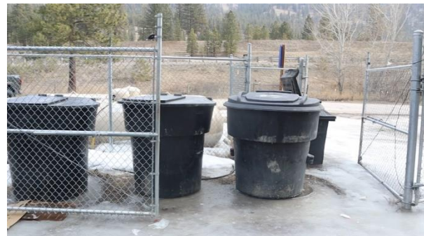
Chain link garbage enclosure at River Edge Resort in Alberton.

Most homeowners in Alberton and nearby areas use Republic Services as their garbage pickup service. Some residents have voluntarily acquired bear resistant garbage bins from Republic Services to secure their household garbage, but this number is a minority. Most residents are still using non-bear resistant containers that can be easily tipped over and rummaged through by bears. Evidence