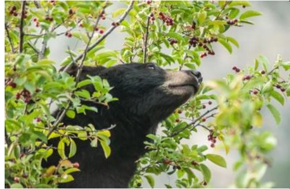
Bear eating chokecherries.

Some Bear Smart communities, like Virginia City, MT have implemented fruit gleaning programs to pick chokecherries in late summer, eliminating them as a bear attractant. The management recommendation for Alberton is to educate the public about these plants and their attractiveness to bears, and then monitor for significant bear use. Individual landowners, at their discretion, may choose to remove the plants from their property to reduce the attraction to bears.