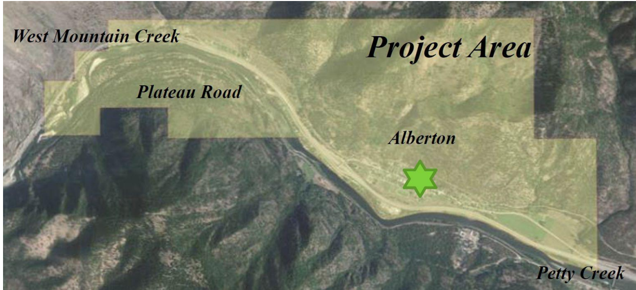
Map of area covered by the Management Plan

this area may consider themselves part of the Alberton community, and bear-human conflicts occur both inside and outside the area. The mapped area identifies the priority area for immediate focus, but it may be expanded in the future as public interest and resources allow.