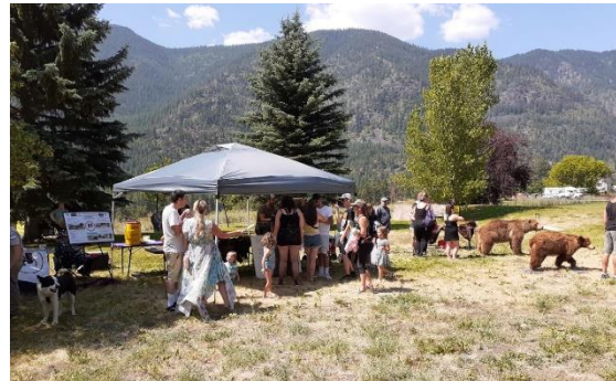
BSAWG conducted public outreach at Alberton Railroad Day 2023.