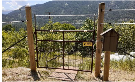
Electric fencing at Brovold Community Orchard.

Electric fencing is the best way to eliminate fruit as a bear attractant. Fences can be either permanent or set up temporarily each year. MFWP has prepared a manual on constructing electrified bear fencing . With the help of the manual, building an effective electric fence is not beyond the capability of most homeowners. Another approach to eliminating fruit as a bear attractant is harvesting the fruit before it becomes ripe enough to attract bears. This is a good option for homeowners who do not plan to use the fruit themselves. In some communities, gleaning programs have been established for this purpose. Volunteers remove the fruit each year with the homeowners' permission. This could be a worthwhile effort in Alberton.