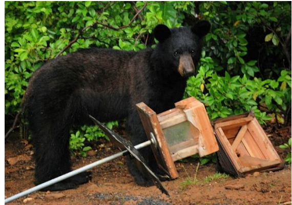
Bear raiding a bird feeder.

It should be noted here that feeding of most wildlife species is illegal under Montana state law, and there has been at least one past incident of intentional feeding of bears in the Alberton area. Intentionally feeding bears, or taking other actions that indirectly but routinely make food available to bears, are citable offenses under the law.